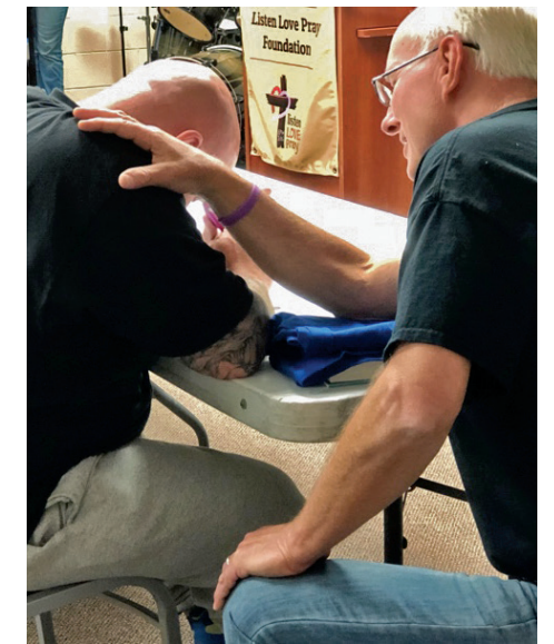
Listen Love Pray Foundation brings healing and hope to individuals working to live free from substance use disorder and create better lives moving forward. Grants from The Malamet Family Fund supported the Foundation's programs to help prevent relapse and promote long term recovery for men and women.