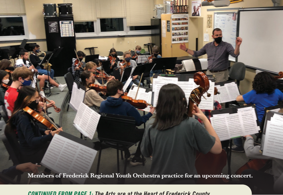
Members of Frederick Regional Youth Orchestra practice for an upcoming concert.

CONTINUED FROM PAGE 1: The Arts are at the Heart of Frederick County