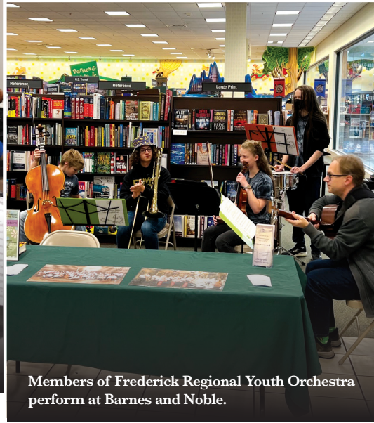
Members of Frederick Regional Youth Orchestra perform at Barnes and Noble.

CONTINUED FROM PAGE 1: The Arts are at the Heart of Frederick County