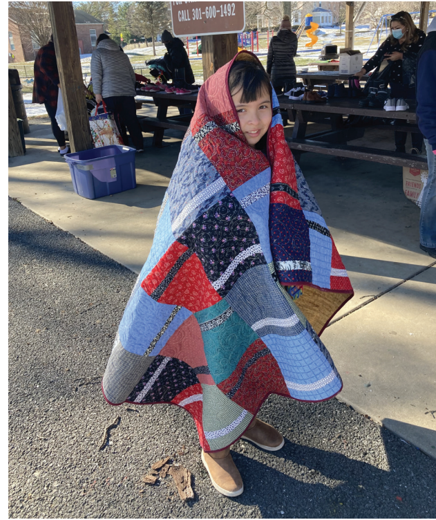
Children of Incarcerated Parents Partnership, Inc. (COIPP) provides basic human needs to children impacted by the incarceration of a loved one. An unrestricted grant from The Kiwanis Club of Frederick Fund helped carry out COIPP's mission to hold a Sharing Fair, where this young girl received a beautiful, quilted blanket crafted by one of COIPP's donors.

Phoenix Foundation of Maryland received grants from The Responding to Substance Use Disorder Strategic Initiatives Fund and The Kiwanis Club of Frederick Fund to support the Phoenix Recovery Academy, located in Frederick. The group of students and teachers pictured here are enjoying a bowling outing, which provides students with sober recreational activities to experience new outlets for coping, as well as to create positive associations with these activities.