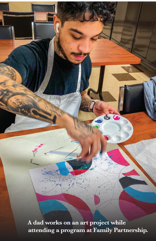
A dad works on an art project while attending a program at Family Partnership.

These are just a handful of the many arts-related grants and scholarships the Community Foundation supports all across Frederick County, year after year, even when a global pandemic disrupts life. To learn more about funds supporting the arts, visit www.FrederickCountyGives.org .