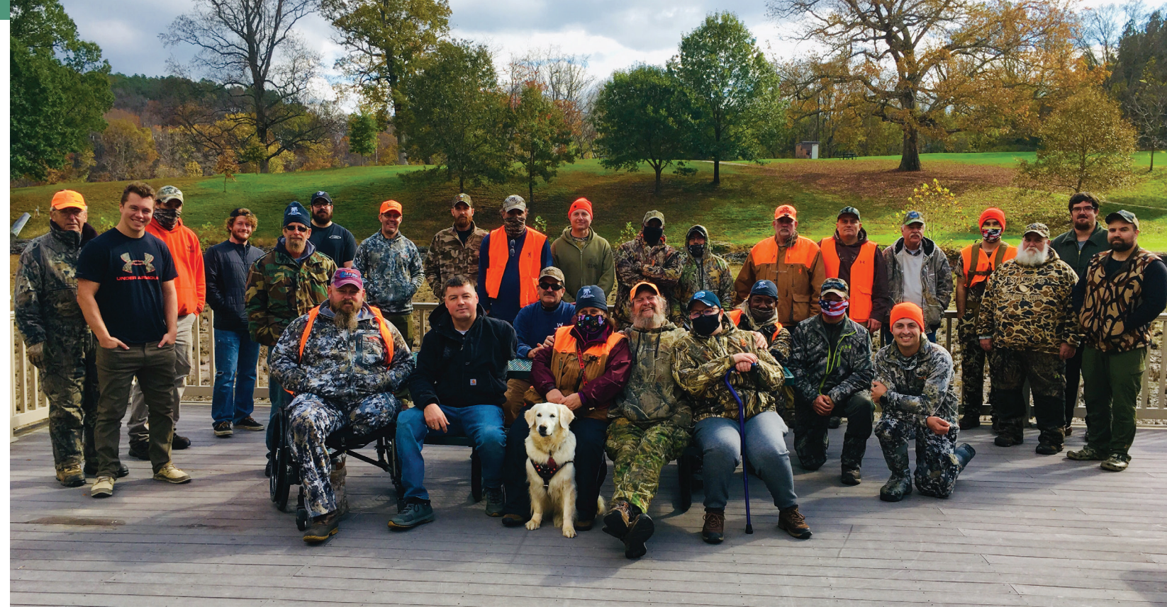
NPLB Outdoors supports veterans through a variety of outdoor activities and outings. This group participated in an organized deer hunt for veterans at the Triadelphia Reservoir. A grant from The Grove Foundation Fund supported this Libertytown-based organization and its efforts to support veterans.