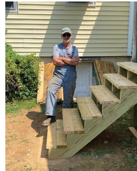
A grant from The Rosebud Frederick Senior Support Fund helped Habitat for Humanity install new stairs on the home of a local senior.