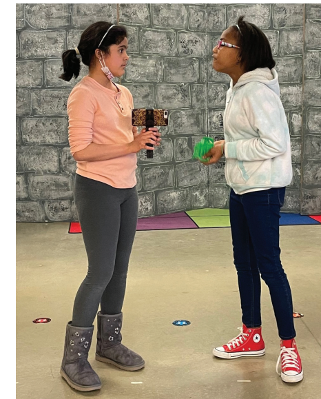
Maryland Ensemble Theatre received a grant from The Frederick Mutual Insurance Company Donor-Advised Fund enabling them to serve community youth through their FUN Company's in-school program. North Frederick Elementary School students are shown here rehearsing for their performance of "We Are Monsters."