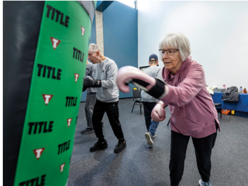
Seniors participate in YMCA of Frederick County's Rock Steady Boxing program. The program, supporting individuals with Parkinson's Disease, received a grant from THE ADDIE B. NULL HEALTH CARE FUND .

Thanks to the support of donors, last year the Community Foundation distributed $5.9 million in grants to hundreds of nonprofits serving in the areas of health and human services, youth programs, historic preservation, basic human needs, the arts, elder care, animal well-being, the environment, and so much more.