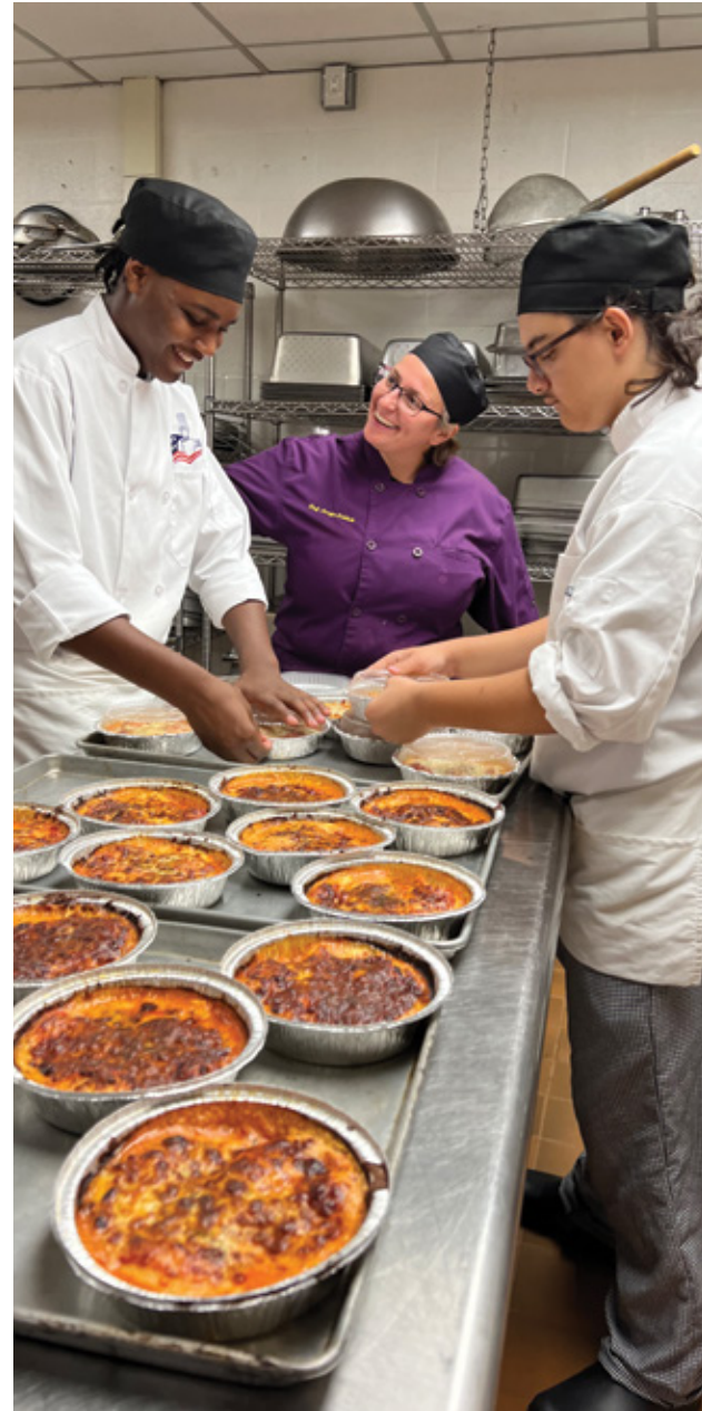
THE JAY "DOC" GEISER FUND provides grants that support students in the Culinary Arts Program at the Frederick County Public Schools Career and Technology Center. These grants cover the costs of professional certifications to prepare students for continuing education and the workforce.