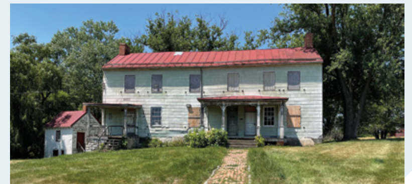
A grant from THE BEATTY CRAMER HOUSE ENDOWMENT FUND supported the preservation, ongoing maintenance and operation of the Betty Cramer House. Built in 1732, the home is Frederick County's oldest known house and represents a remarkable blend of Dutch, English, and American carpentry techniques.