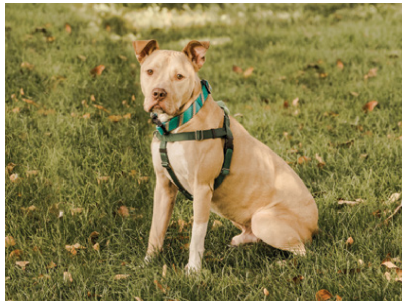
A grant from THE H. REESE AND JEANNETTE K. SHOEMAKER CHARITABLE FUND helped the Frederick County Division of Animal Control support dogs like Achilles as they waited for a loving home.