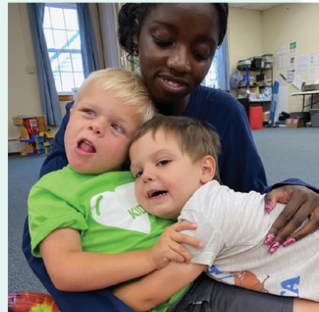
YMCA of Frederick County's Kids Unlimited program provides summer camps for children with autism and other special needs. A grant from THE FREDERICK KEYS CARE FUND supports program activities like arts and crafts, sensory play, sports, and group games.