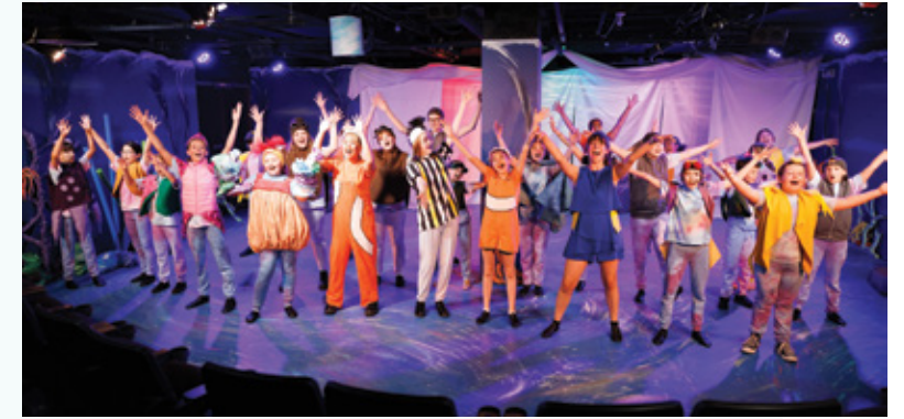
A grant from THE DR. GEORGE AND CAROLYN SMITH FUND provided support for Maryland Ensemble Theatre, Inc.'s summer show of Finding Nemo, Jr.